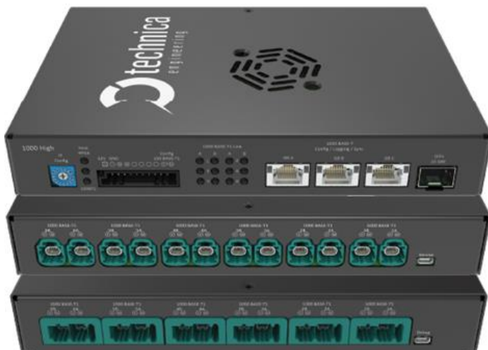
Capture Module 1000High

Several Capture Modules can be combined and used together in the same measurement network. The built-in time synchronization feature allows to synchronize the whole measurement network with the same time base. This makes the Capture Modules very scalable and allows to add other IVN technologies to the measurement setup.